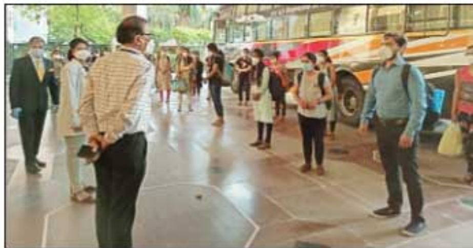
A team of doctors of MGIMS, Sevagram, leaving for Mumbai.

The notification came under Epidemic Diseases Act, Disaster Management Act, and Maharashtra Essential Service Maintenance Act. This is the first incidence where Brihanmumbai Municipal Corporation (BMC) has sought help from outside Mumbai. "A total of 45 final year residents from 13 different specialities left for Mumbai in two buses with a single motive to contribute to the ongoing pandemic. Our residents shall be serving